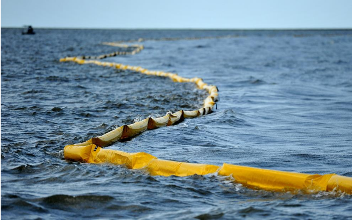
Oil Boom used to protect Louisiana's wetlands is put into place on Lake Machias.