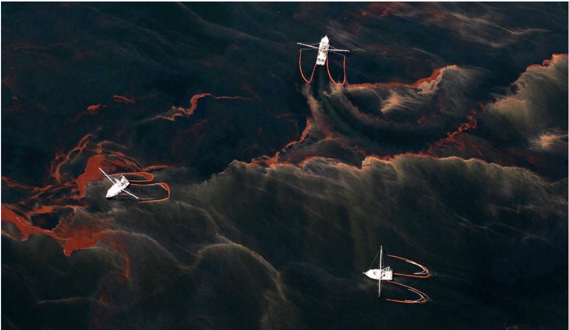
Shrimp boats are used to collect oil using oil booms.