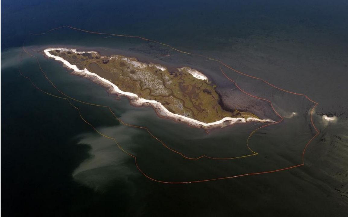
New Harbour Island protected by two oil-booms against the oil slick.

This challenge will require a tremendous effort for each and every member of our company. The challenges of additional work days, overtime hours and weekend production will be necessary to meet the urgent demands for our product. This extra effort will most likely occur during the next 3 to 4 weeks.